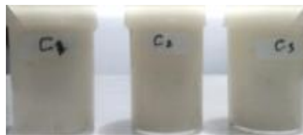
Figure 2. Snail slime emulgel (Formula C as best formula)

This test was carried out for 6 cycles and the most stable formula C was produced, compared to 2 other formulas. This was indicated by the unchanged preparation after passing 6 cycles.