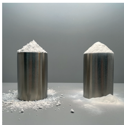
Flowability comparison of different glidants

Regulatory and quality aspects: All CompactCel® FLO formulations are developed to meet the official regulatory requirements of the user's country for pharmaceutical products and nutritional or dietary supplements.