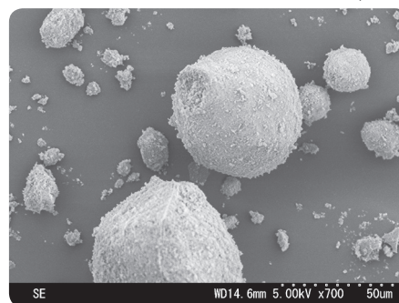
Neusilin® S1 (x700)